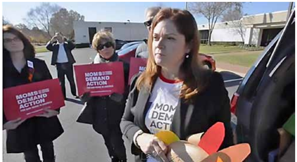
Screenshot of Youtube video of Group of Harris Teeter protesters