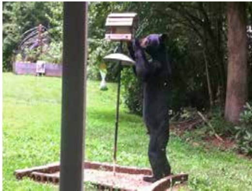
As wild animals like black bears become more prevalent in suburban areas, encounters with humans become more common and can potentially be life-threatening.

Some years later, Texas governor Rick Perry was out walking his dog in Austin, TX, when a coyote came out of the brush and approached them. The animal showed no fear of the man or his dog and continued to advance. As I mentioned, this is a clear indication that the coyote might well have been rabid. Perry's Ruger .380 ACP took care of the problem before he, or his pet, could have been bitten.